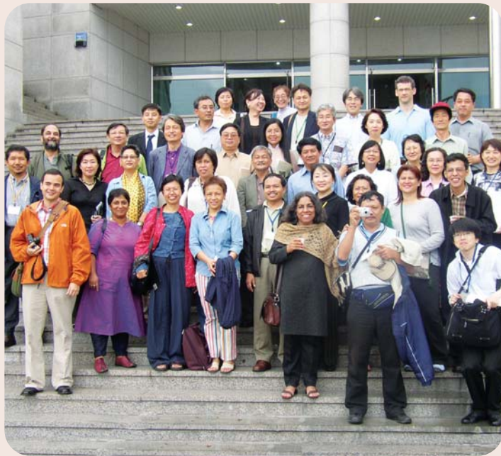
2005 Reunion (Democracy Park, Busan, Korea)