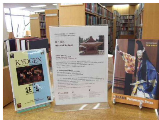
Nō and Kyōgen