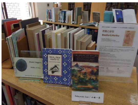
Basho & Haiku