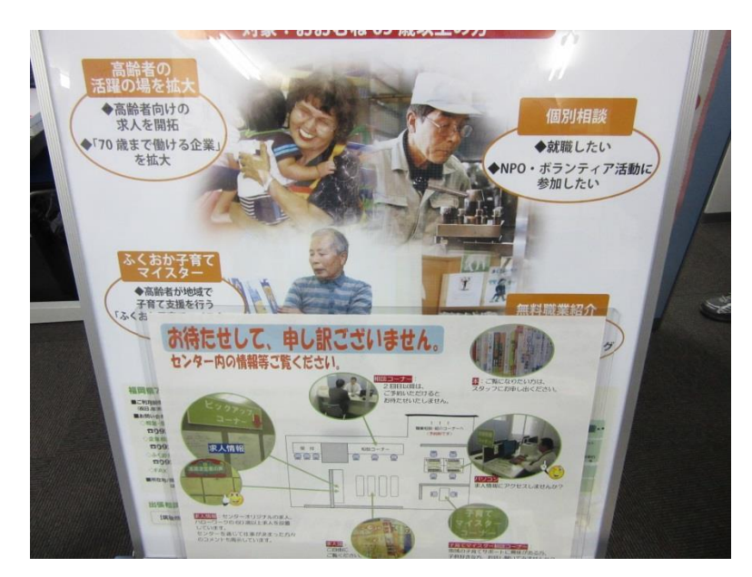
Figure 10: Growth and development for aging society is a lifelong process.

This paper is presented here as received from the author. Its contents are the author's sole responsibility.