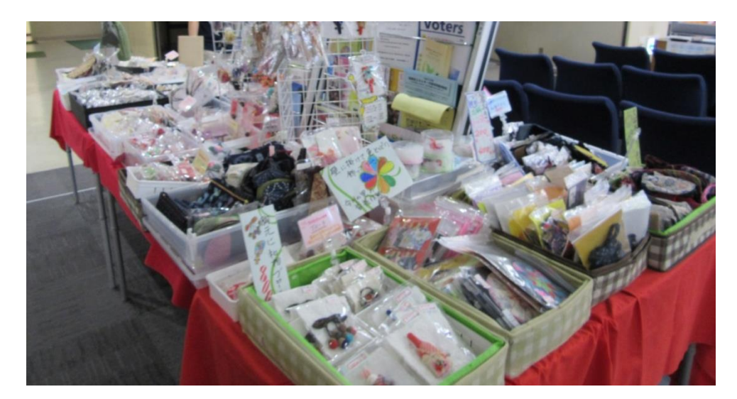
Figure 1: Items made by the local community for the Sakura market.

The growth and development of the local community here involved the process of empowering the local community to take charge of their own lives, helping them to activate their creativity and indulge in activities that make them feel useful, responsible and dignified. It was such a joy to see the local senior women cooking a nice lunch for us and how delighted they were to pack onigiri (rice balls) for us to take back. They were very happy preparing the meal as a team and we felt honored to be served by such respectful citizens of the local community. Even the Mayor joined us for lunch in spite of his hectic and busy schedule. It all goes without saying how communal support can help in the growth and development of the local community.