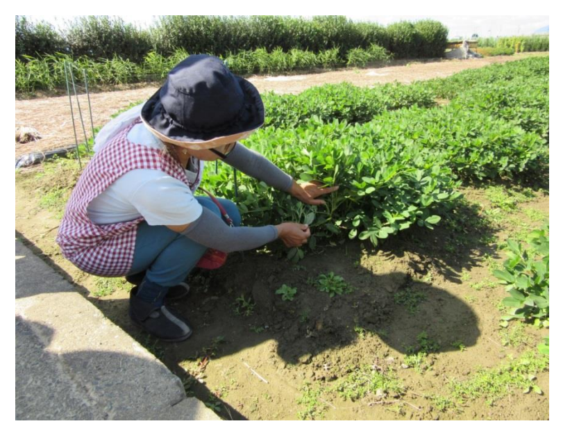
Figure 3: A farmer showing her peanut farm which is almost ready to harvest.

When we visited the farms, the women farmers proudly showed their farming produce such as lettuce and peanut. They were explaining thoroughly how they went about multitasking, between their role as a house wife, preparing meals for the family and then spending about six to eight hours in the farm. This was such a challenging task which the women of Tachiarai shouldered proudly. We met only the women and when one of my colleagues asked where their husbands were, they responded that they were doing work at home. We did see some men clearing plots of land using the tractor. As for their children, if they are around, they usually come and give a helping hand during the weekends.