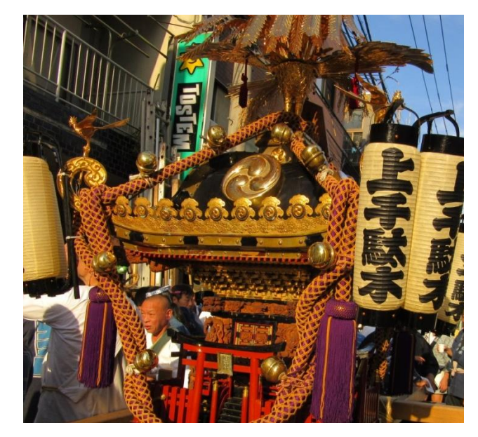
Figure 4: The mikoshi that we shouldered from 3pm to 8pm.

Mikoshi in Japan is a divine palanquin (some translate as portable Shinto shrine). Shinto followers believe that it serves as the vehicle to transport a deity in Japan while moving between main shrine and temporary shrine during a festival or when moving to a new shrine. In our case, the mikoshi was involving a neighborhood matsuri (Japanese festival) and the people involved in bearing the mikoshi were all neighborhood individuals who knew each other. They roped in friends to make the event merrier and give a helping hand in bearing the mikoshi . That's how our Japanese friend roped us in, through her contacts with the local community leaders.