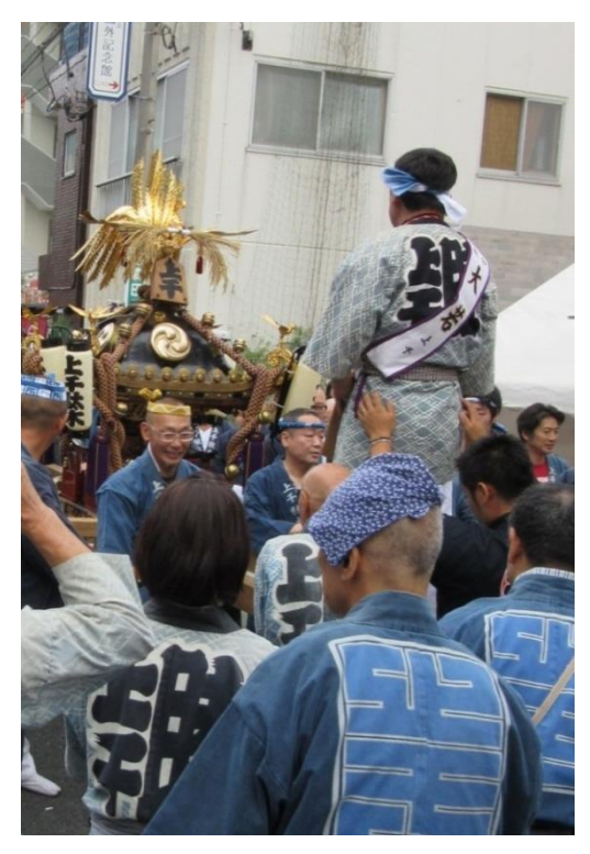
Figure 5: People getting ready to catch the chief as he drops backward.

I only noticed the trust put upon by the chief when I was asked to be the front bearer of the mikoshi . Because of the quick team work that everyone got to carry the mikoshi simultaneously, the chief will just drop his body backward and his whole team is ready to catch him as the mikoshi bearers lift the mikoshi and shoulder it in a split second. It is such a splendid act of responsibility, teamwork and total trustworthiness.