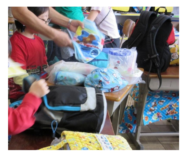
Figure 7: Teacher shows how to fold towel while another student practice packing his bag.

From my experience to the elementary school, a lot can be learnt about the education system in Japan and how the administrators of schools can make a difference if they are more innovative and creative in developing students to be proactive and take charge of their own learning with facilitation from their teachers and content experts.