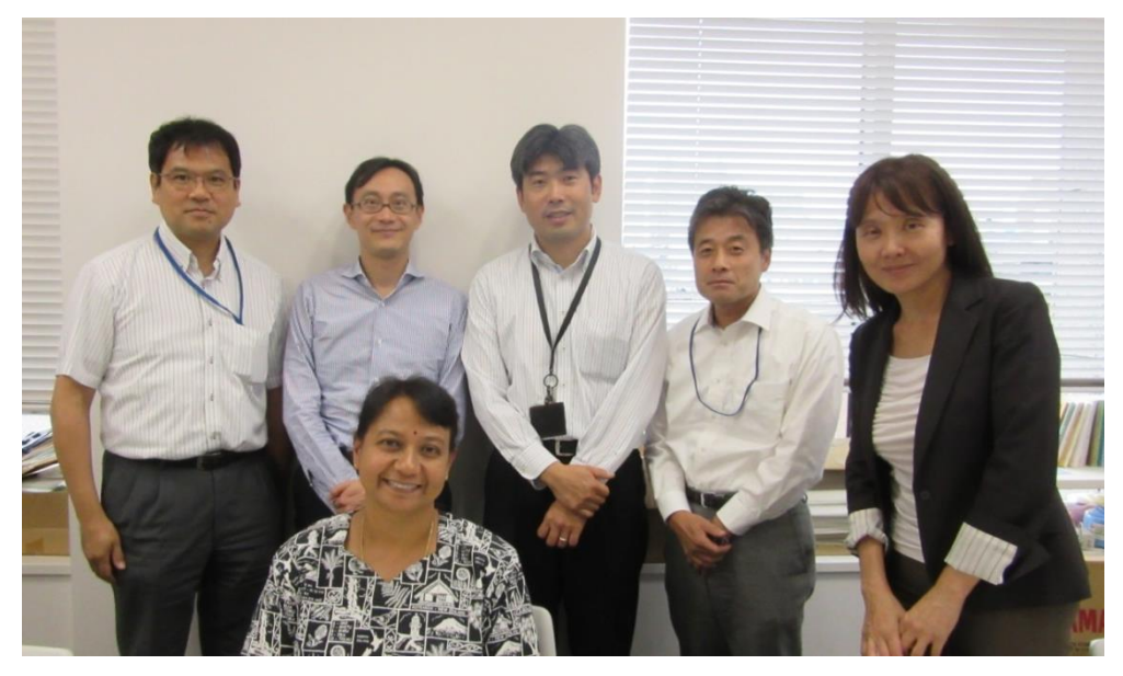
Figure 9: Visha with five senior researchers of Ministry of Education, Sports, Culture, Science and Technology (MEXT).