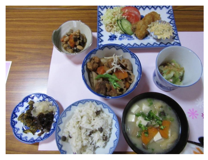
Figure 2: Food prepared by the local senior women with lots of care and love.

The growth and development of the local community here involved the process of empowering the local community to take charge of their own lives, helping them to activate their creativity and indulge in activities that make them feel useful, responsible and dignified. It was such a joy to see the local senior women cooking a nice lunch for us and how delighted they were to pack onigiri (rice balls) for us to take back. They were very happy preparing the meal as a team and we felt honored to be served by such respectful citizens of the local community. Even the Mayor joined us for lunch in spite of his hectic and busy schedule. It all goes without saying how communal support can help in the growth and development of the local community.